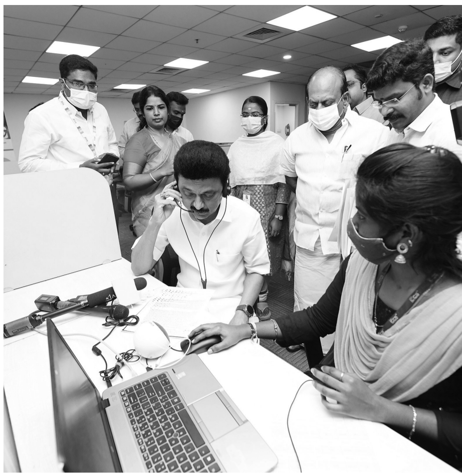
Chief Minister Stalin paid a surprise visit to the CM Call Centre in Sholinganallur and attended a few calls from callers to enquire about their grievances. Minister for MSMEs T.M. Anbarasan and senior officials were present.